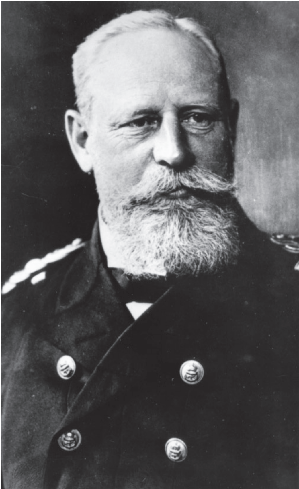
Fig 1. Admiral Henning von Holtzendorff.