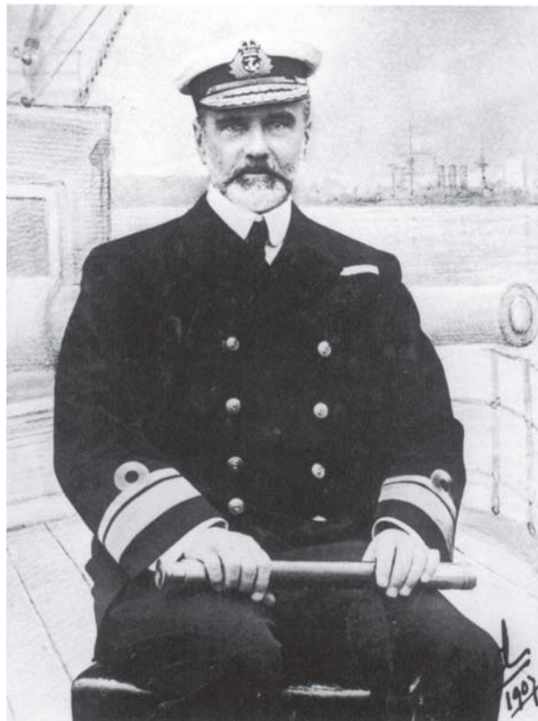
Fig 3. Admiral Sir Frederick Inglefield, when Rear Admiral in command of the 4 th Cruiser Squadron, 1907. © National Maritime Museum, London. Negative number P6010.