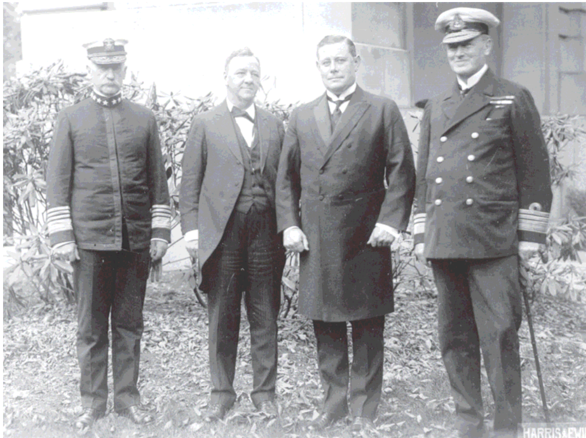
Fig 2. Admiral A L Duff with (left to right) Admiral Benson USN, Mr Daniels and Sir Eric Geddes.

(one of the Central Committee of the BIR): ‘We are practically cut off from all contact with the navy, except such part of it as is hostile to BIR.’ 21 That month the organization of anti-submarine work was improved by the creation of the Anti-Submarine Division (ASD) under the direction of Rear Admiral A.L. Duff. 22 Jellicoe later reflected that the ASD ‘received much valuable assistance from the great civilian scientists who gave such ready help during the war, the function of the naval officers working with the scientists being to see that the effort was being directed along practical lines’. 23